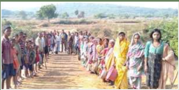
Villagers are carrying stones to the other end of the bridge